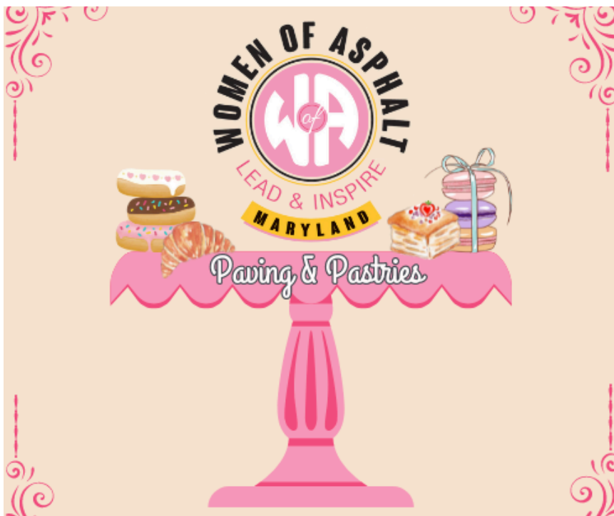
PAGE 4 | PAVING & PASTRIES- SCHEDULE YOUR SESSION