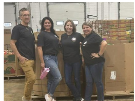
PAGE 4 | MFB VOLUNTEERING