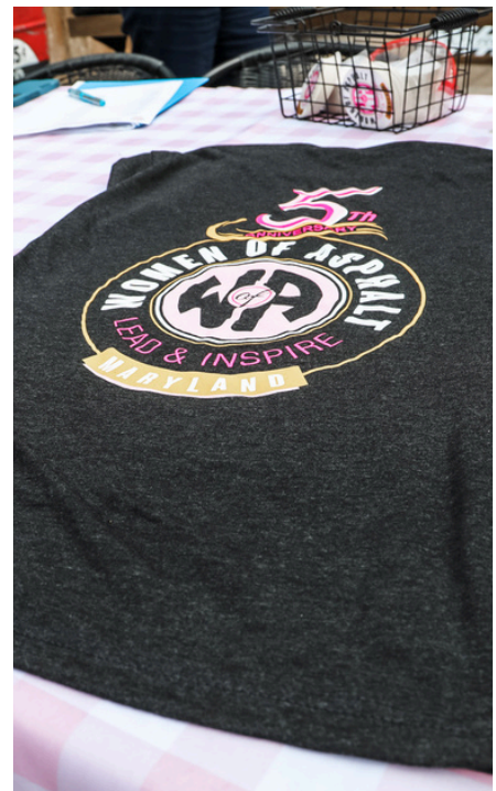
PAGE 4 | SAVE THE DATE!